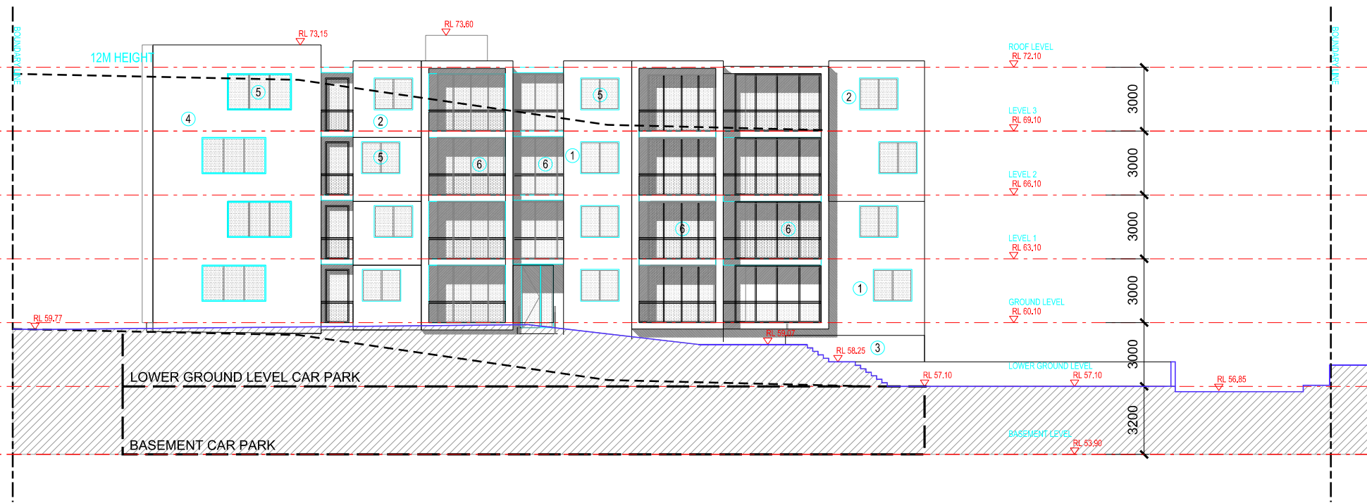
02 ELEVATION 6 BLOCK E NORTH ELEVATION